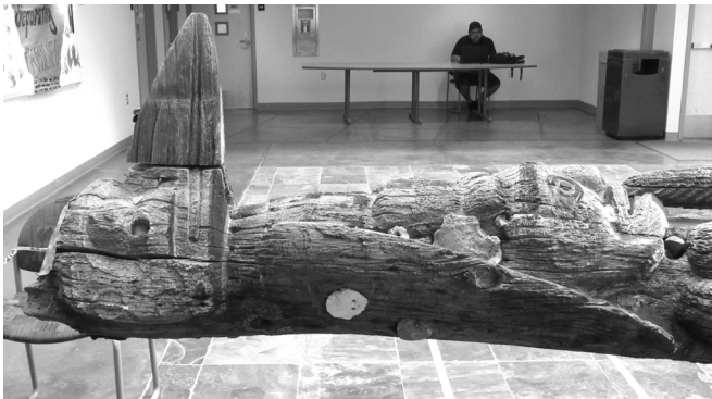
Figure 4. Detail of the pole showing numerous concrete and plaster fills in the kingfisher figure's proper right side. Note the beak, which does not match the head.

The original paint had been mostly lost, as well as much of the re-painting done at UNM at some point after the pole was first installed in 1941. In addition, there were losses in the wood as well as some missing appendages, namely the whale tail and flippers and the wolf ears. The head of the topmost figure, the kingfisher, suffered major losses, including the area behind the beak, likely due to exposure to the elements (Fig. 4).