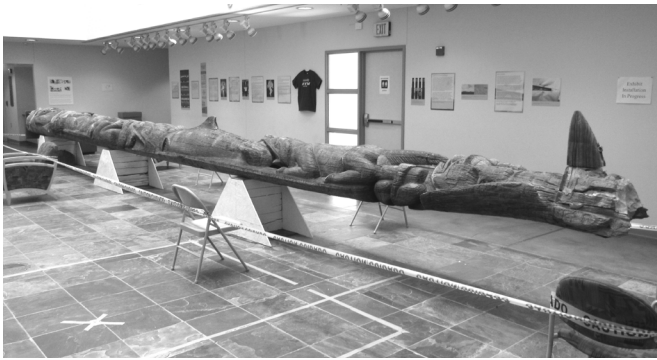
Figure 3. The pole on sawhorses after being moved to the atrium of the Hibben Center, ready to be prepared for the carvers. The area with the “X” in the foreground indicates where the pole will be mounted.

The original paint had been mostly lost, as well as much of the re-painting done at UNM at some point after the pole was first installed in 1941. In addition, there were losses in the wood as well as some missing appendages, namely the whale tail and flippers and the wolf ears. The head of the topmost figure, the kingfisher, suffered major losses, including the area behind the beak, likely due to exposure to the elements (Fig. 4).