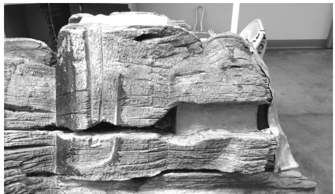
Figure 7. Detail of the Araldite fills in the kingfisher head as seen from the proper left side of the head. The fill for the beak is the light-colored flat surface on the top of the image; the other is the light-colored rectangle recessed into the large loss along the side of the head. Neither of these fills would be visible after attachment of the replacement beak and red cedar surface fills along the large gap.

To meet the above criteria, the conservators selected Araldite AV 1253, a two-part epoxy putty with phenolic microballoons for the fills. The putty was applied over a barrier layer of mulberry tissue affixed to the surfaces of the loss with methyl cellulose. The first Araldite fill was made in the area directly behind the beak, and so was brought flush with the surface. The second fill, located in the large loss along the proper left side of the kingfisher's head, was recessed to provide room for the carvers to attach a superficial cedar wood fill on top of the Araldite (Fig. 7).