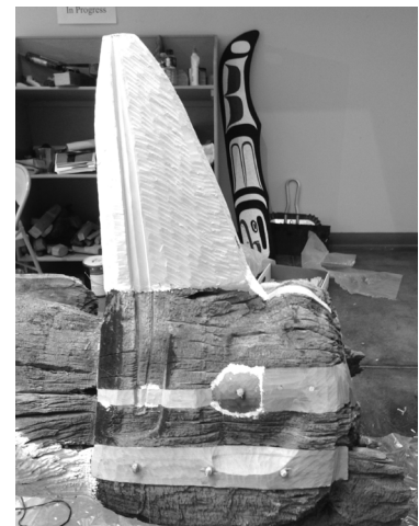
Figure 8: Detail of the proper left side of the kingfisher head, with the beak and cedar fills in place. The beak is fully shaped and already painted white, while the cedar fills along the side have only been roughed in. The white ring is Milliput epoxy putty filling gaps around the cedar plug. The small wooden pegs would be cut down to be invisible.

This cedar fill and the newly carved cedar beak were both secured into the Araldite fill by first drilling and then inserting traditional wood pegs, set in place with a commercial wood glue (Fig. 8).