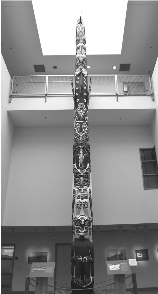
Figure 11. The Smith Family Pole, mounted inside the atrium of the Hibben Center.

The finished pole was mounted in its designated spot in the Hibben Center atrium in May 2017 (Fig. 11). As part of the agreement between UNM and the Smith family, funds will be acquired for another pole to be carved and raised where the stolen pole had stood.